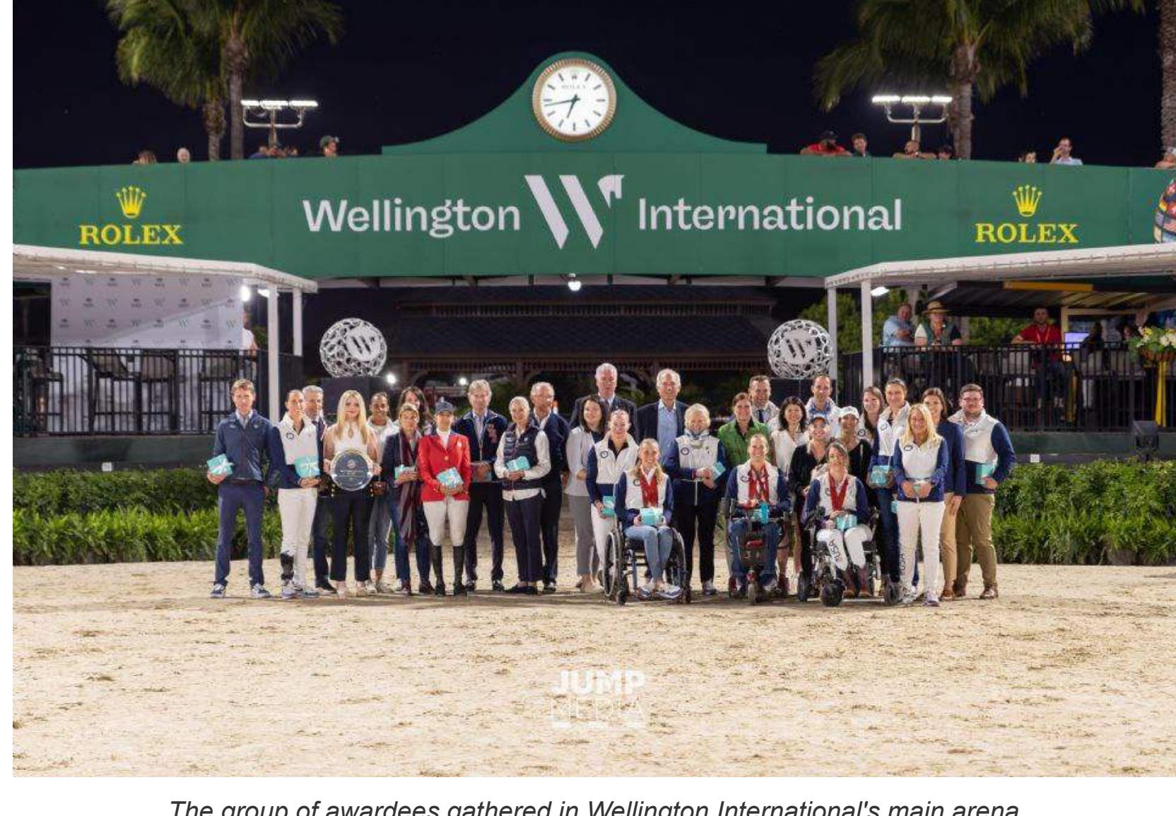
The group of awardees gathered in Wellington International's main arena.