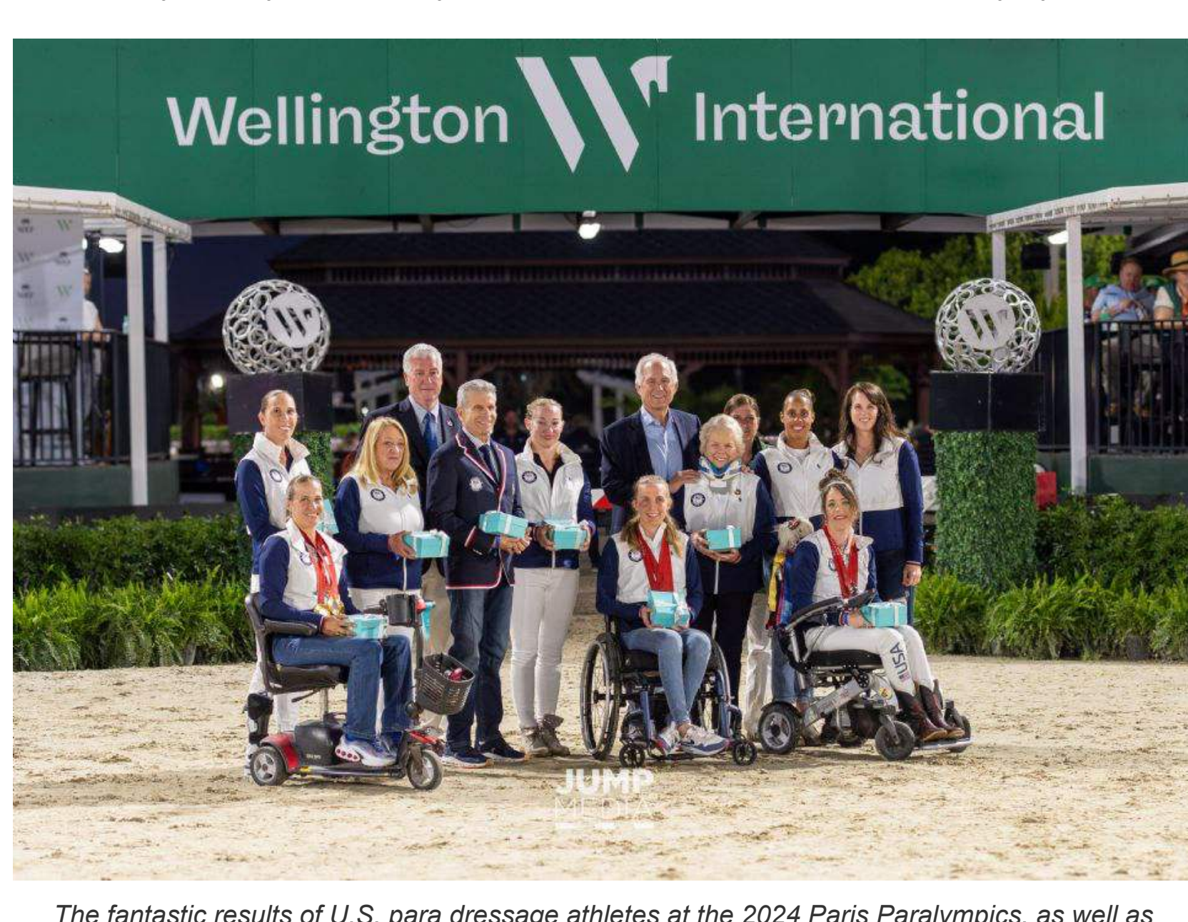
The fantastic results of U.S. para dressage athletes at the 2024 Paris Paralympics, as well as the horse owners and team leaders, were celebrated in Wellington.