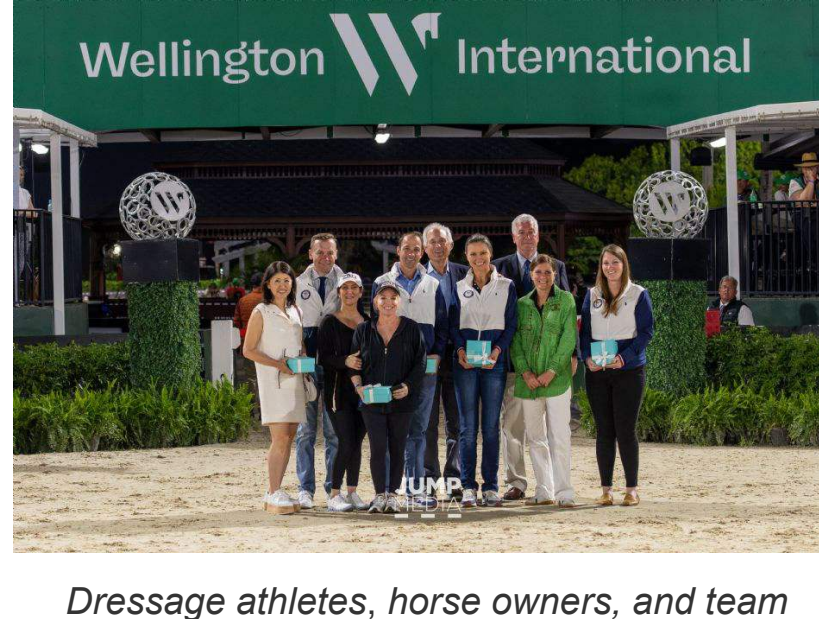
Dressage athletes, horse owners, and team leaders from the 2024 Paris Olympic Games were honored.