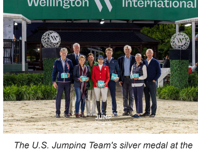
The U.S. Jumping Team's silver medalist at the 2024 Paris Olympic Games was recognized during the Nations Cup class at Wellington International.