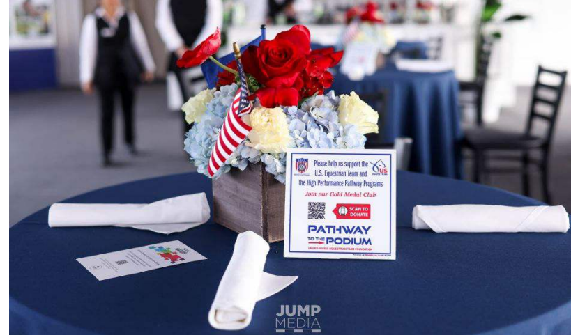
Table settings at the reception featured information on the USET Foundation's Pathway to the Podium campaign.