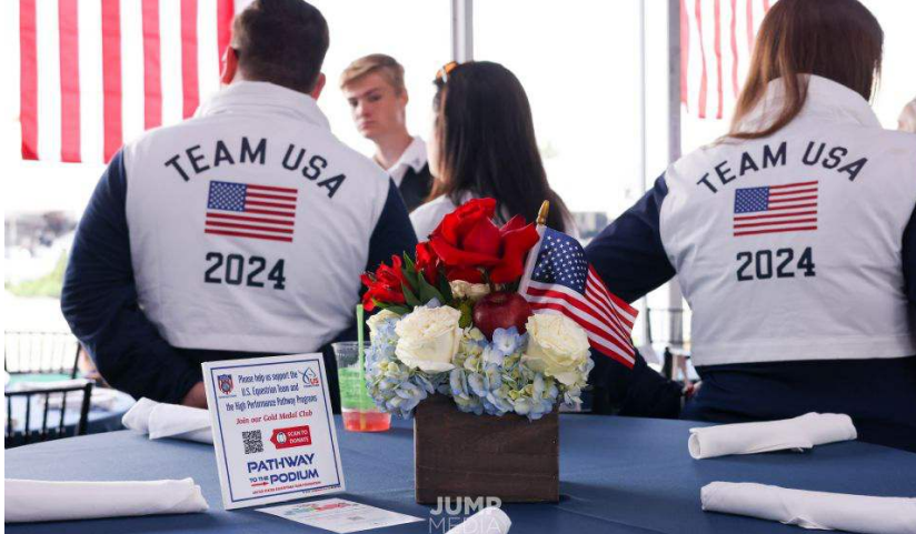
The unwavering spirit of U.S. team supporters was evident at the event.