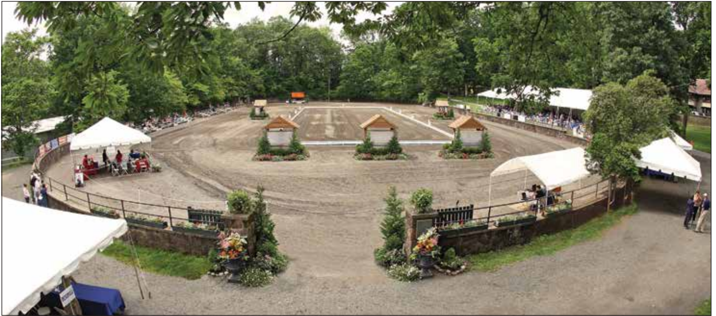
The competition arena set up for the 2009 Collecting Gaits Farm/USSET Dressage Festival of Champions. Landscaping by Statile & Todd, Inc.