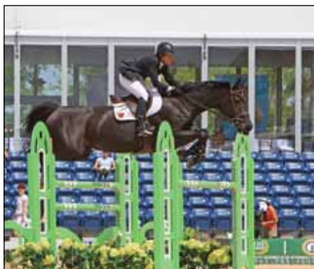
Beezie Madden and Cortes 'C'