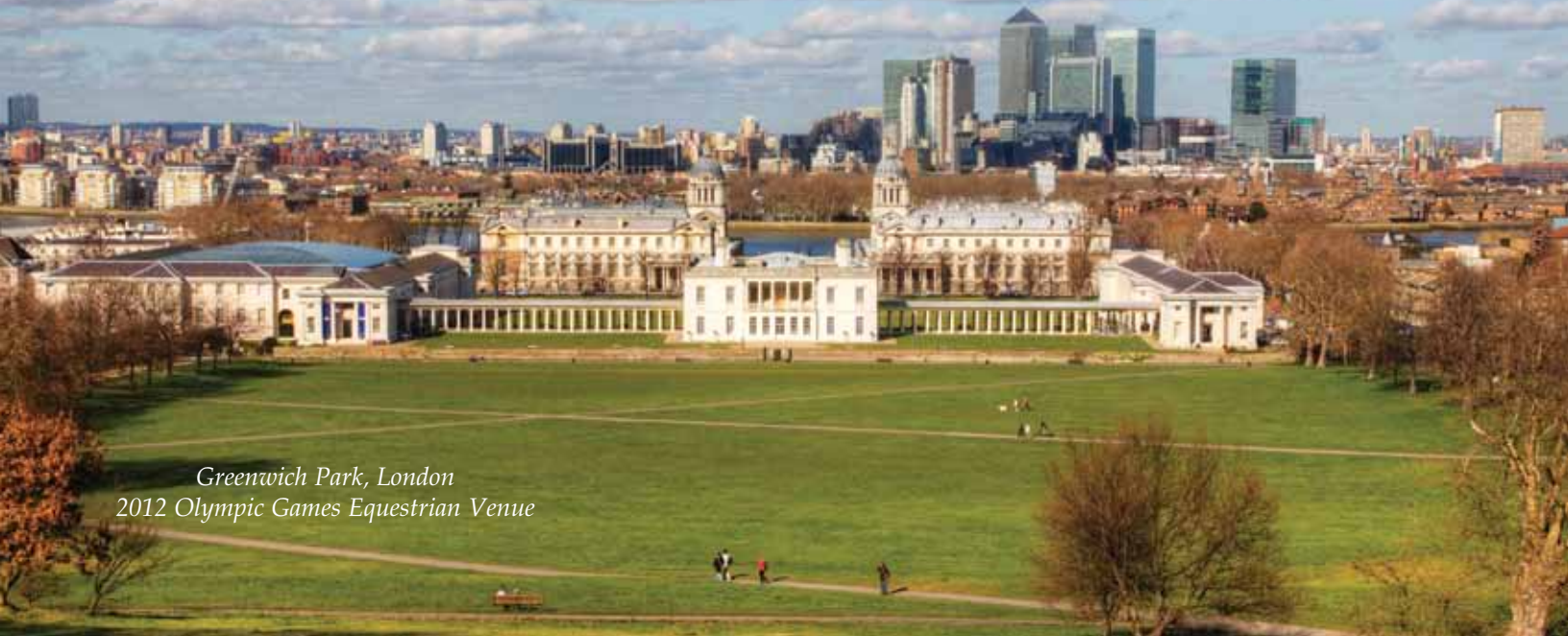
Greenwich Park, London 2012 Olympic Games Equestrian Venue