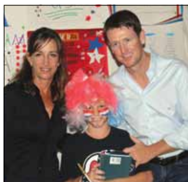
Laura Kraut, Mark Leone, Jr. and McLain Ward