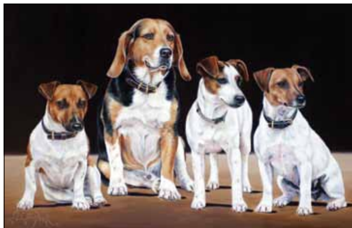
Elle Mae, Snoopy, Jewels and Dippy Doo