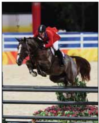
McLain Ward and Sapphire Team Gold Medalist 2004 Athens Olympic Games 2008 Beijing Olympic Games

Riders will receive two hours of clinic instruction for two days, as well as breakfast and lunch daily, one complimentary auditing seat, stabling at Hamilton Farm, and initial bedding. Auditors will have the opportunity to observe all clinic sessions and will receive breakfast and lunch daily.