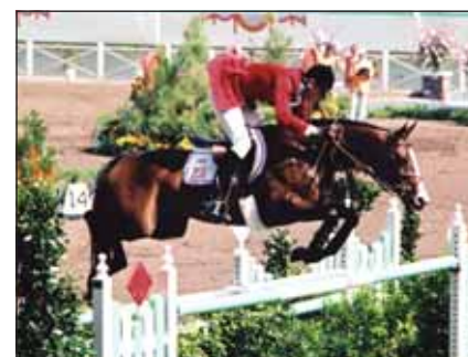
Joe Fargis and Touch of Class Individual and Team Gold Medalist 1984 Los Angeles Olympic Games