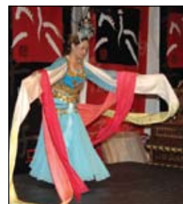
Chinese Ribbon Dancer