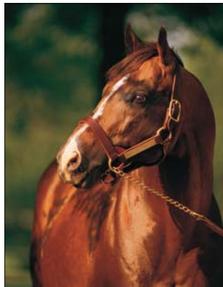
At Lane's End Farm the high bidders had their pictures taken with A.P. Indy, the 1992 Horse of the Year and a Leading Sire.

While the men went to the Fenwick Farms' Sky Terrace table on 'Millionaires Row', the ladies headed for the barns where they had passes to go into the saddling paddock. "There were thousands of people crushed up against the fence looking into that paddock and we just walked on down there! That was cool,"