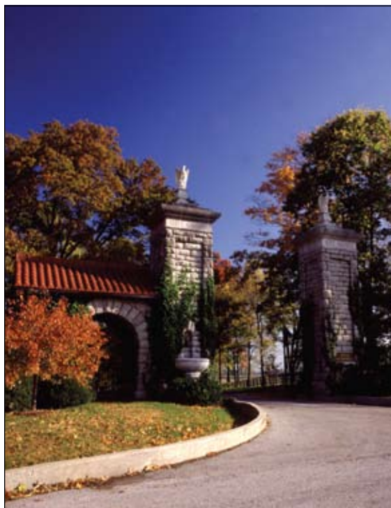
At Ashford Stud, the Home of Champions, in Versailles, KY, the Derby Package winners visited breeding sheds, talked with handlers, and were privy to a breeding by legendary Giant's Causeway.