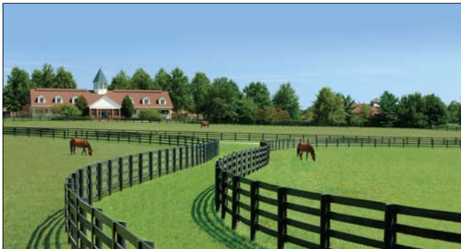
On their VIP tour of renowned Kentucky Thoroughbred breeding farms, the Derby Package winners visited Ashford Stud, Darley, and the beautiful Lane's End Farm (shown above) located outside of Lexington, KY.