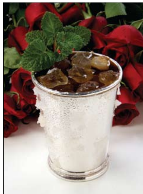
At the Kentucky Derby, the VIP group enjoyed traditional mint juleps and watched the race from Millionaire's Row in the Sky Terrace of Churchill Downs.