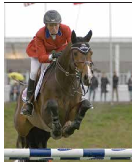
Beezie Madden and Authentic at St. Gallen, Switzerland.

The U.S. show jumping squad, for the first time since the inception of the Super League, found themselves at the bottom looking up, after falling all the way to last place in the standings following another disappointing showing at the Piazza di Sienna in Rome, May 24-27.